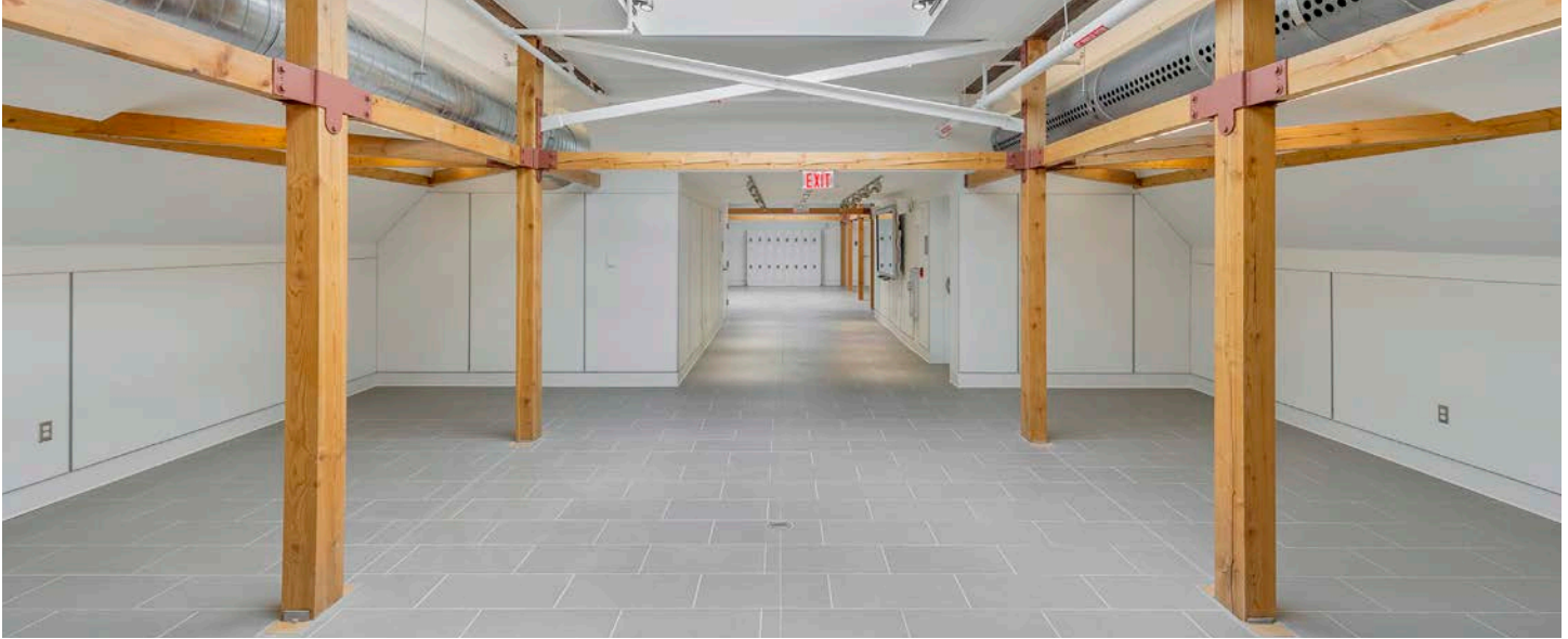
University at Buffalo, Hayes Hall