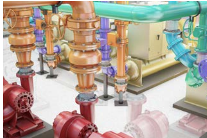
Fortune 500 Client