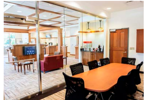
Family First Federal Credit Union