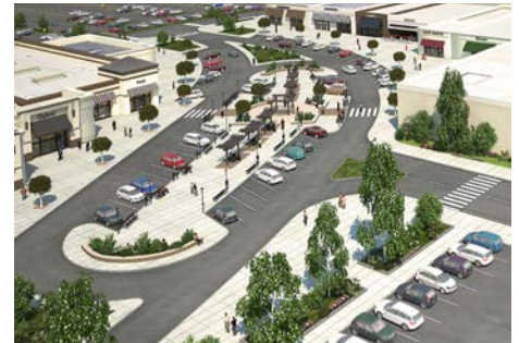
West Manchester Town Center