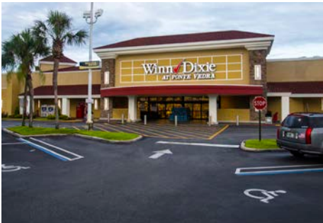
Winn Dixie Supermarket