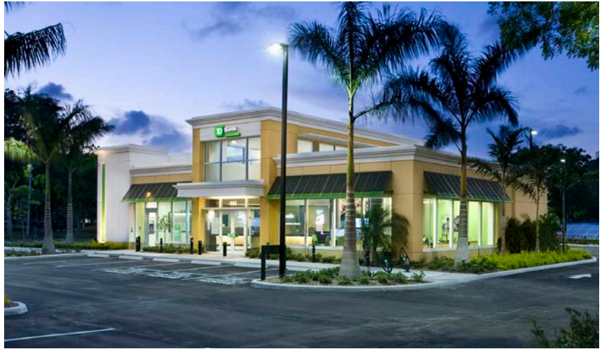
TD Bank Net Zero Branch

We ranked 46 in the Top 100 Architecture/Engineering Firms nationally in 2017.