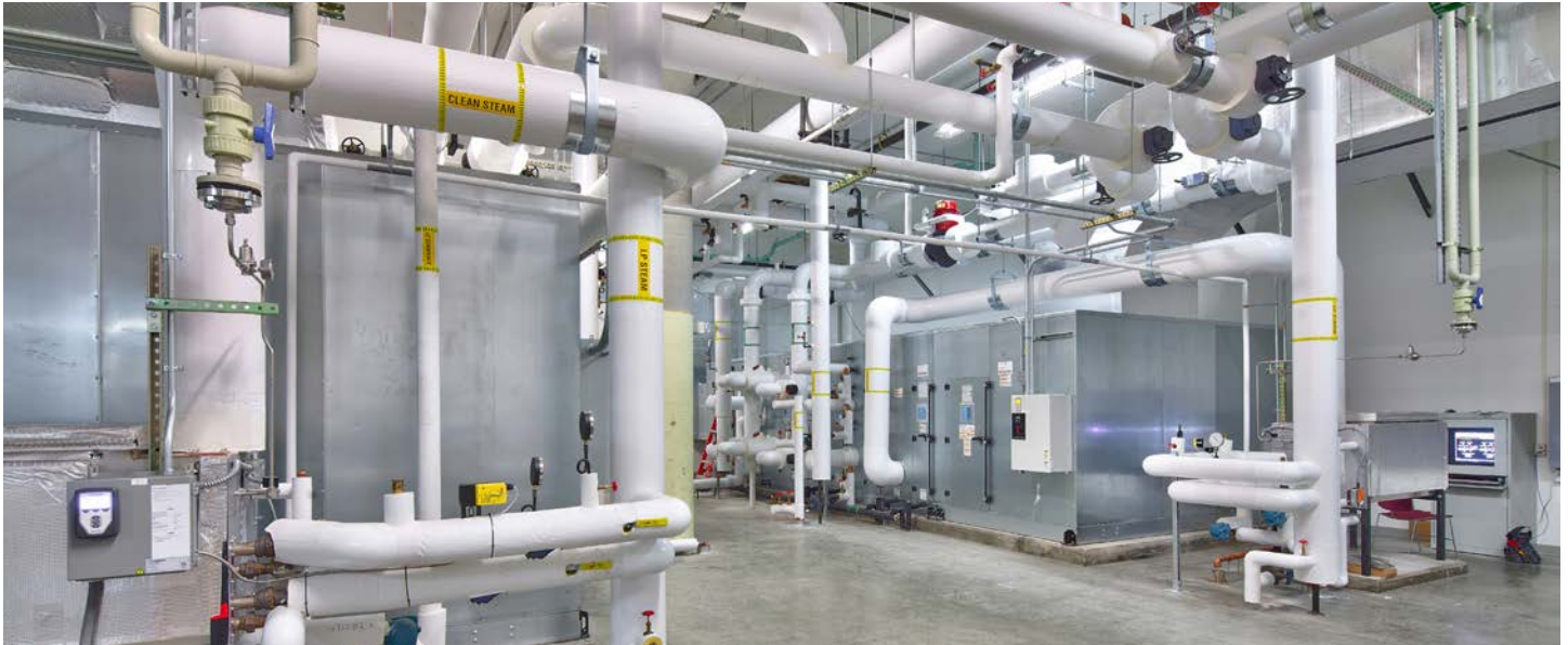
Kodak Building B326 New Manufacturing Process