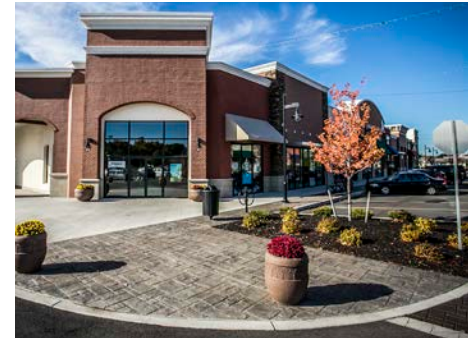
BayTowne Plaza | Webster, NY