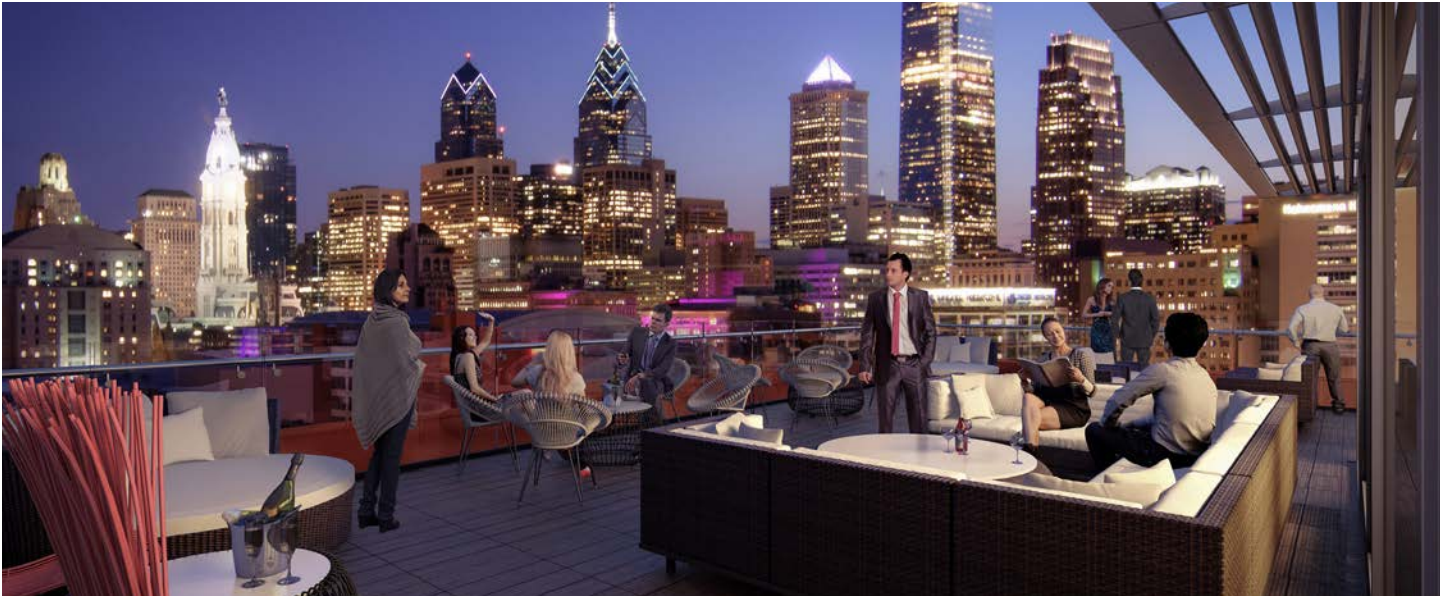
Marriott AC Hotel | Philadelphia, PA