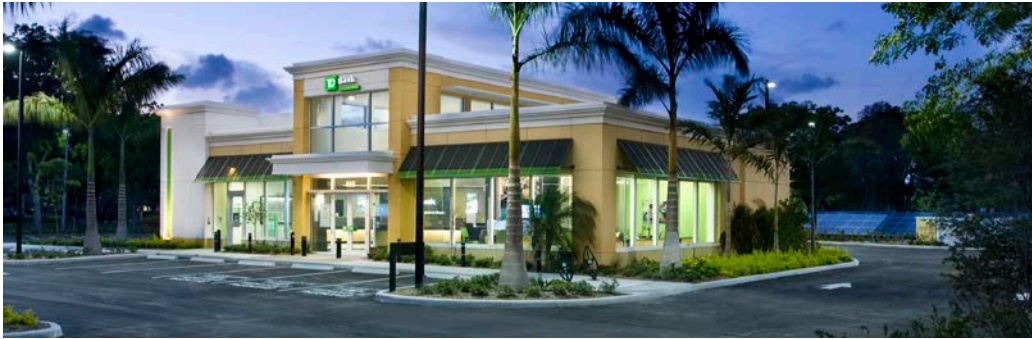
TD Bank Net Zero Store | Ft. Lauderdale, FL