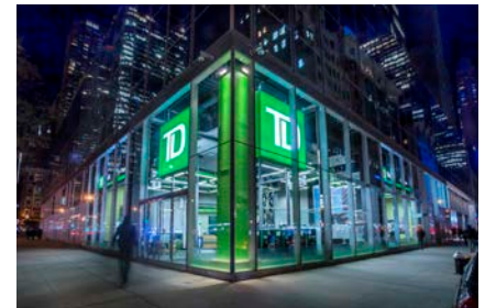
TD Bank | New York, NY