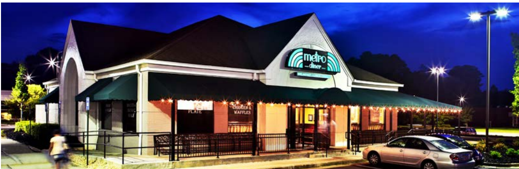
Metro Diner | Macon, GA