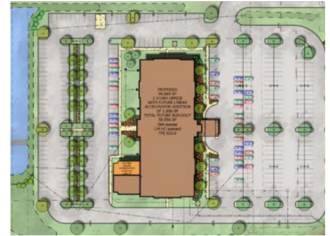
Medical Office Building | Greece, NY