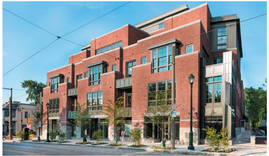
Germantown Mixed Use Development | Chestnut Hill, PA

We ranked 46 in the Top 100 Architecture/Engineering Firms nationally in 2017.