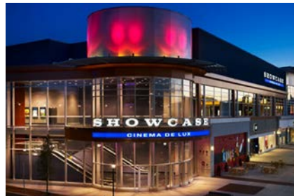
Showcase Cinema De Lux at Legacy Place | Boston, MA