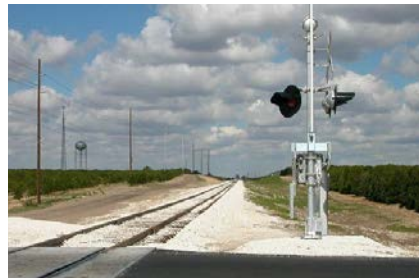
Grade Crossing Improvements