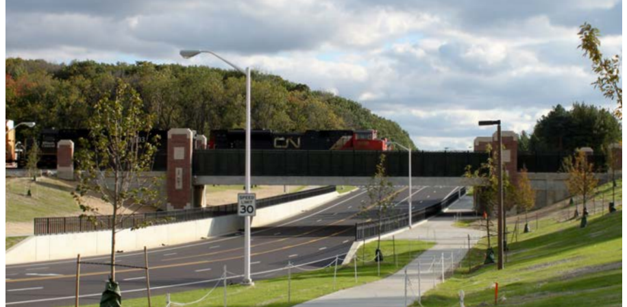
Farm Lane Road & Rail Grade Separation, East Lansing MI

Bergmann designed 18 new or replacement bridges on the new Brightline 235-mile intercity passenger rail system that will connect Orlando to Miami, FL.