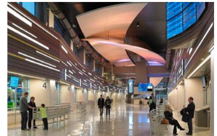
Rochester Regional Transit Center